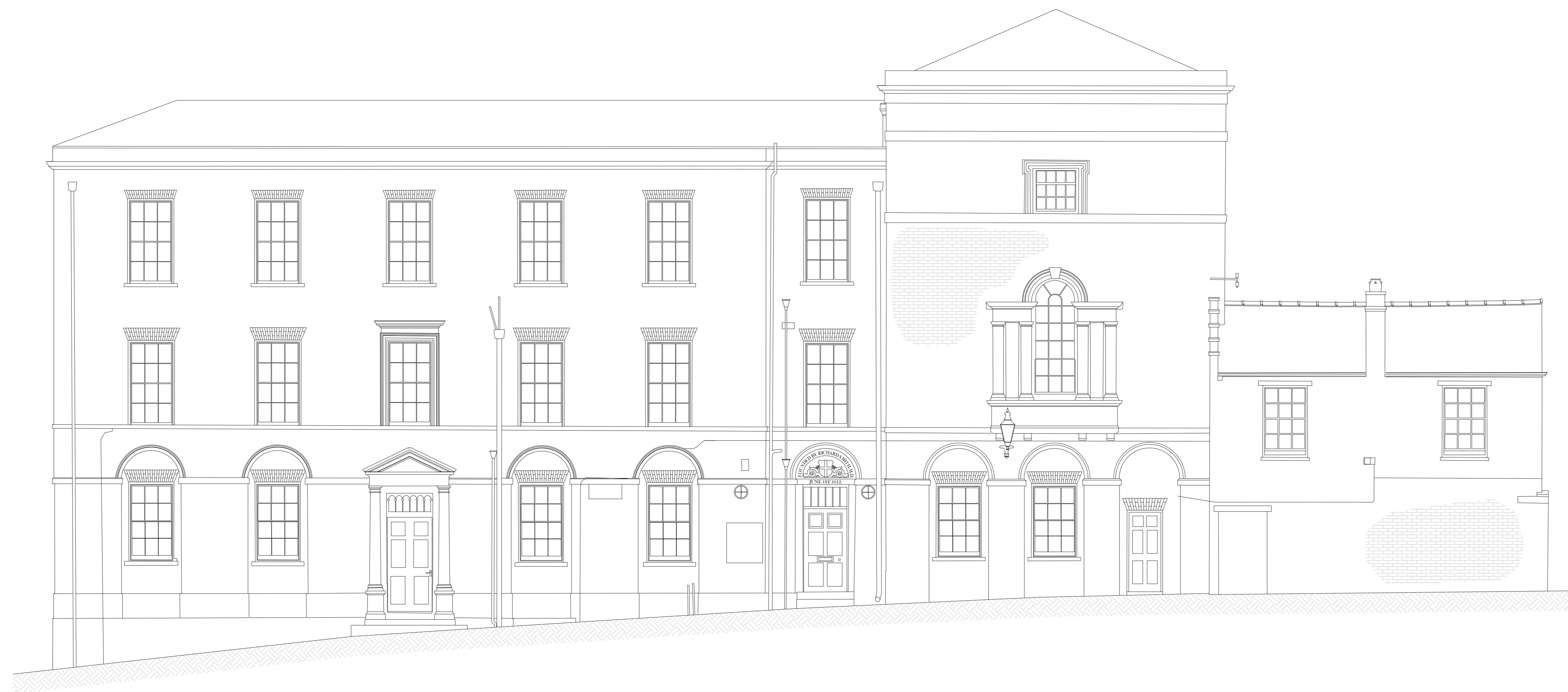
2D Elevation Survey