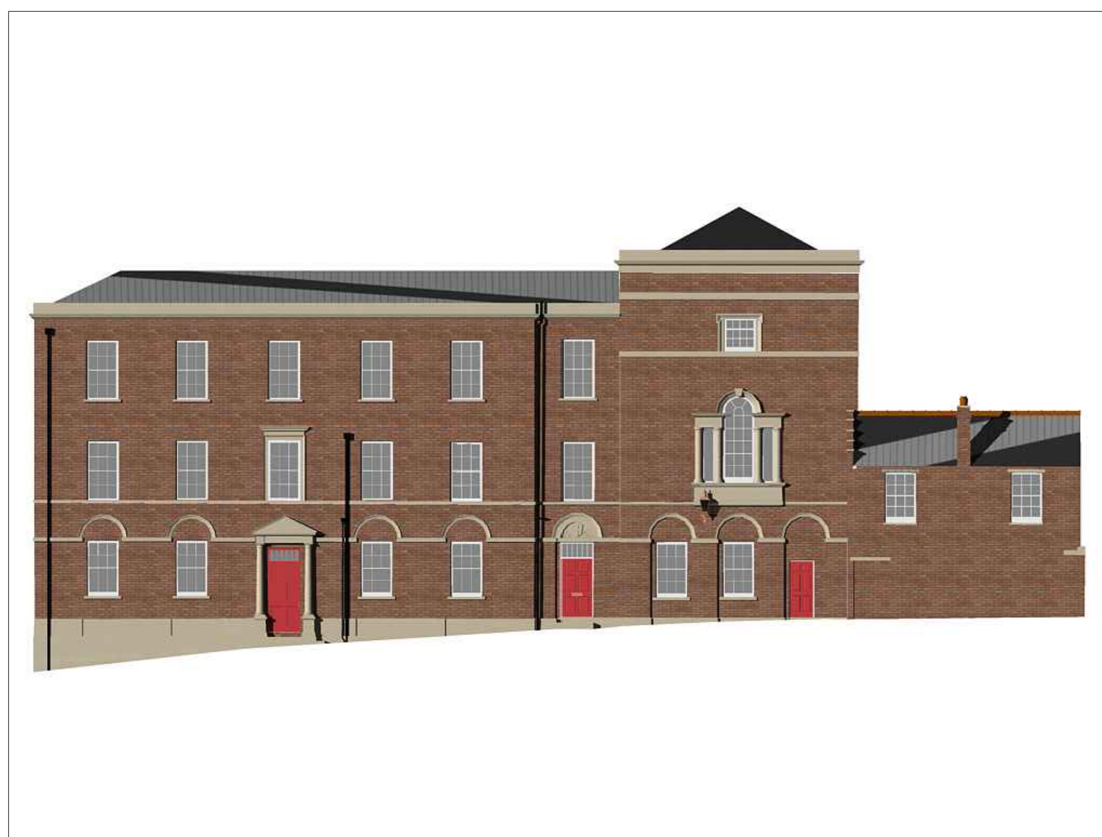
2D Rendered Elevation